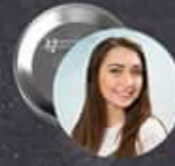
Magnets & Buttons

Please register in your personal school portal: http://parents.clixkids.com