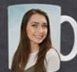
Mugs & Drinkware